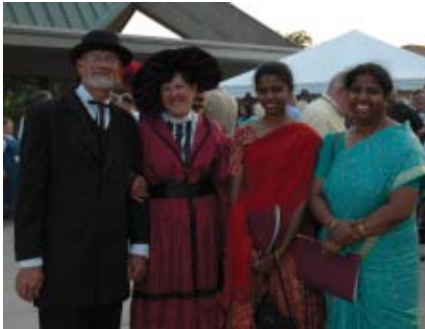
The Hoffmeiers, in period dress, pose with opening worship attendees.