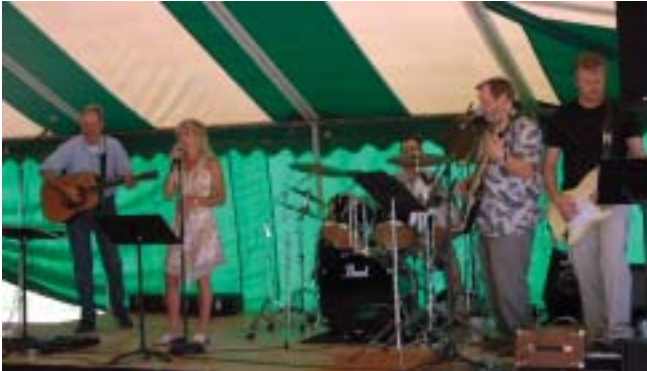
Praise Team from Christ the Good Shepherd, Canton