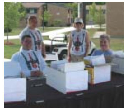
Concordia University Housing Staff