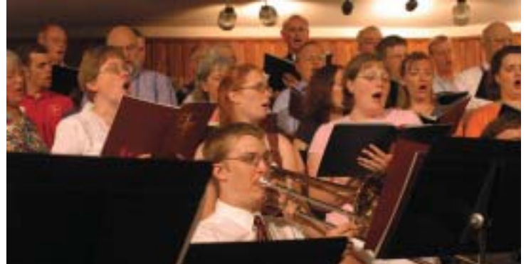
Convention Vocal and Brass Choirs