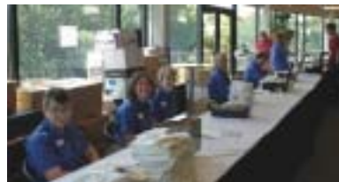
District Support Staff at Registration