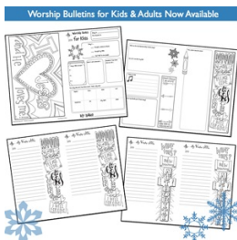
Worship Bulletins for Kids & Adults Now Available

Worship Notes for Kids for January are free and available to download here . These FREE bulletins are designed to engage children (preschool and up) through the entire service. Because they are listening for words spoken, they are learning the liturgy and biblical accounts. This resource also provides opportunities for family conversations and prayer requests throughout the week. My Worship Notes (for adults) are also now available to download here . Both of these resources are following the Lectionary and will