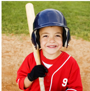
New by Chuck Strohacker