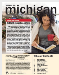
December 2017 Michigan In Touch Supplement