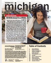
December 2017 Michigan In Touch Supplement