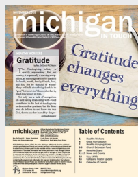
November 2018 Michigan In Touch Supplement